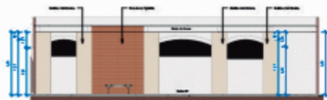
2 Corte B 1:100