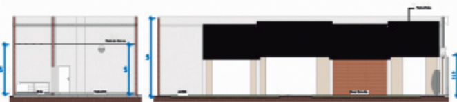
5 Corte E 1:100