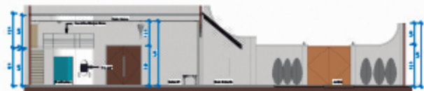
1 Corte A 1:100