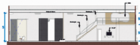
4 Corte D 1:100