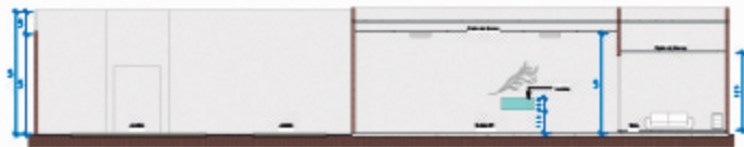
3 Corte C 1:100