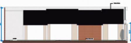
6 Corte F 1:100